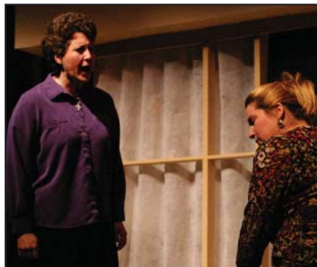
Sleeping Dogs , Winter 2008-2009