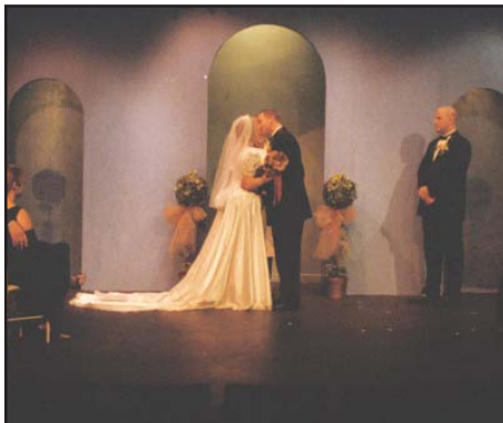
Prelude to a Kiss , Fall 2008