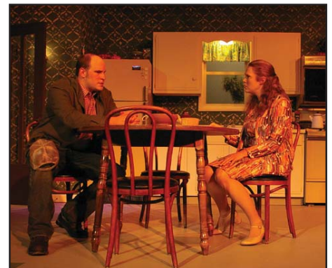
Crimes of the Heart , Spring 2009